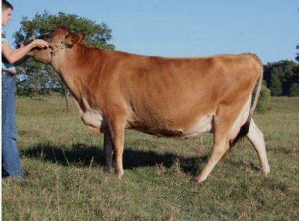
(L) Montana and in the background Landy's Prince, our herd bull. (R) Montana Analise, who is the full sister to Landy's Prince.