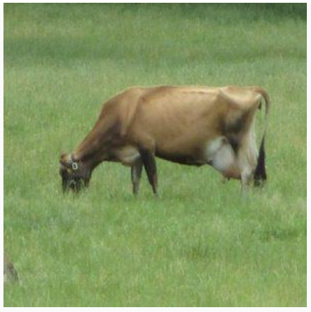
Reba – She is the Dam of Landy's Prince and this is a picture of her at 13.

We purchased two Registered Jersey cows from Cedar Crest Farms in Alabama and began our all Jersey dairy. We initially used semen from New Zealand out of a bull named Duke's Landy. He has been a very good grass genetic bull that is A/2 A/2 in his genetics. He really has been the foundation sire for our herd.